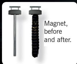
Magnet, before and after.

A corrosion resistant element enables the CombiMag Dual to be used with all power flushing chemicals.